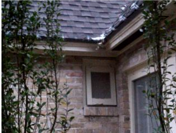
Austin, Texas, January 4, 2013

Blizzard 2013 - only four days into the new year when Blizzard 2013 halts all traffic in Austin until further notice except for emergency vehicles, media, bicycles and Capital Metro buses and trains.