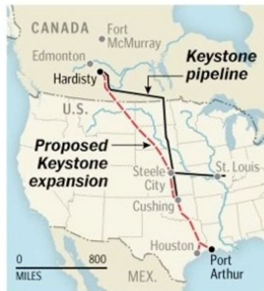
Laris Karklis/The Washington Post

Polyticks - The Keystone XL pipeline would not have to be extended to Cushing much less to Port Arthur if there were refineries in the upper Mid-West such as Steele City, KS.